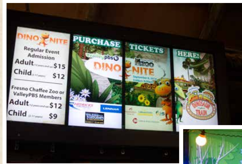
Previously, Dino Nite, ValleyPBS Kids Nite info will appear for 2015 going forward.