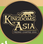
EXHIBIT D & E