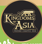
EXHIBIT A, B & C

Kingdoms of Asia, will include new exhibits for Tigers, False Gharials, Asian Songbirds, Komodo Dragons, and a major renovation to the Orangutan habitat.