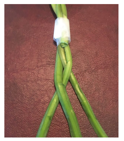
then the left strand over the middle strand,

Keep folding the outside strands over the middle until you reach the end