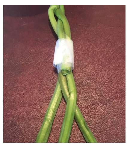
Place the right strand over the middle strand,